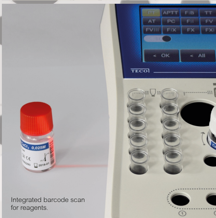
Integrated barcode scan for reagents.